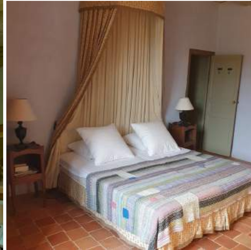
VIII Chambre Lilla (twin/double)