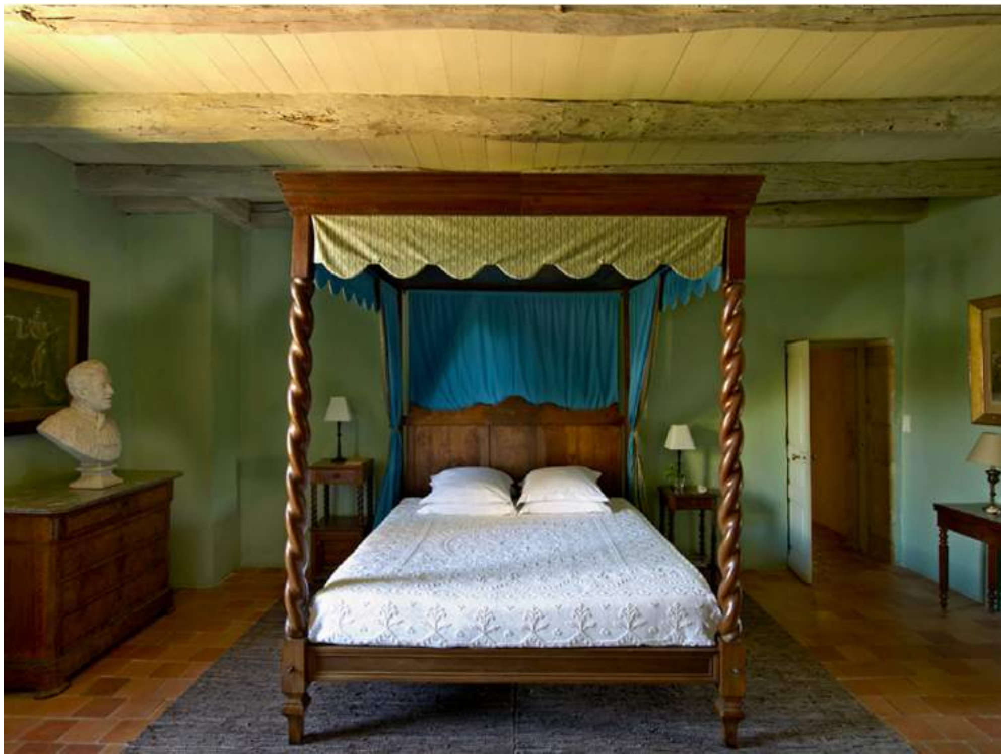
VII BALDAQUIN (double)