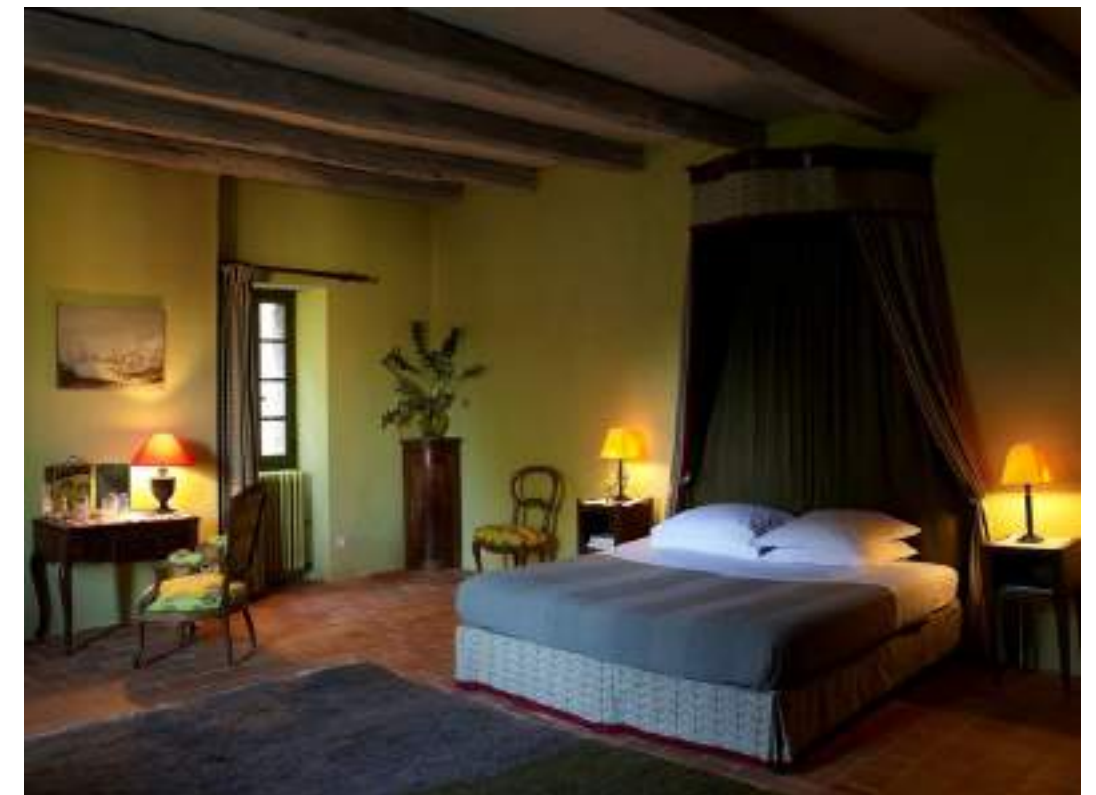
IX Chambre verte (twin/double) + EXTRA KID BED